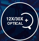
12X/30X Optical Zoom

Equipped with NDI®|HX capability, the PTZ310N/330N provides flexibility and extensive applications through a single IP cable, simplifying live-production workflows by rapidly transmitting various video and audio signals. It presents every angle of studio productions, live events, worship services, auditorium lectures, sports and gaming competitions, online and distance learning classes, multinational conferences, personnel training sessions, and more, enabling users to create truly impressive content. Enjoy efficient and simple setup, and design comprehensive NDI-based productions.