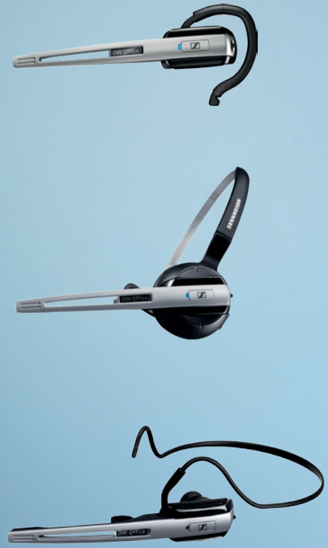
Note: Neckband available as accessory